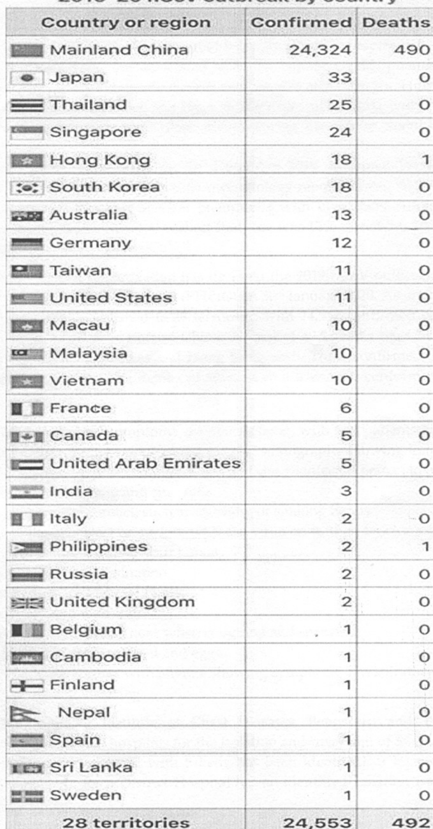
2019–20 nCoV outbreak by country [54]